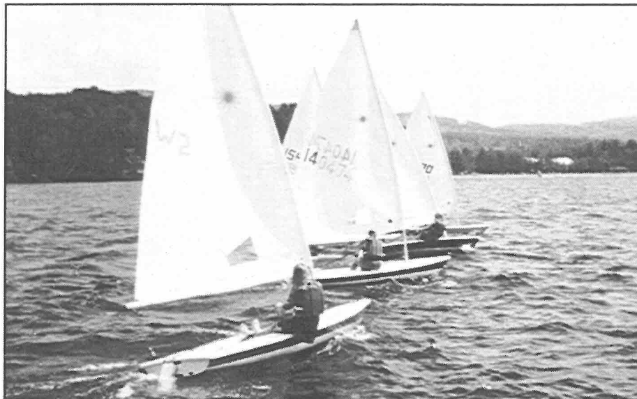
A clean start at the Area A Leiter Cup Finals held in Sander's Bay.